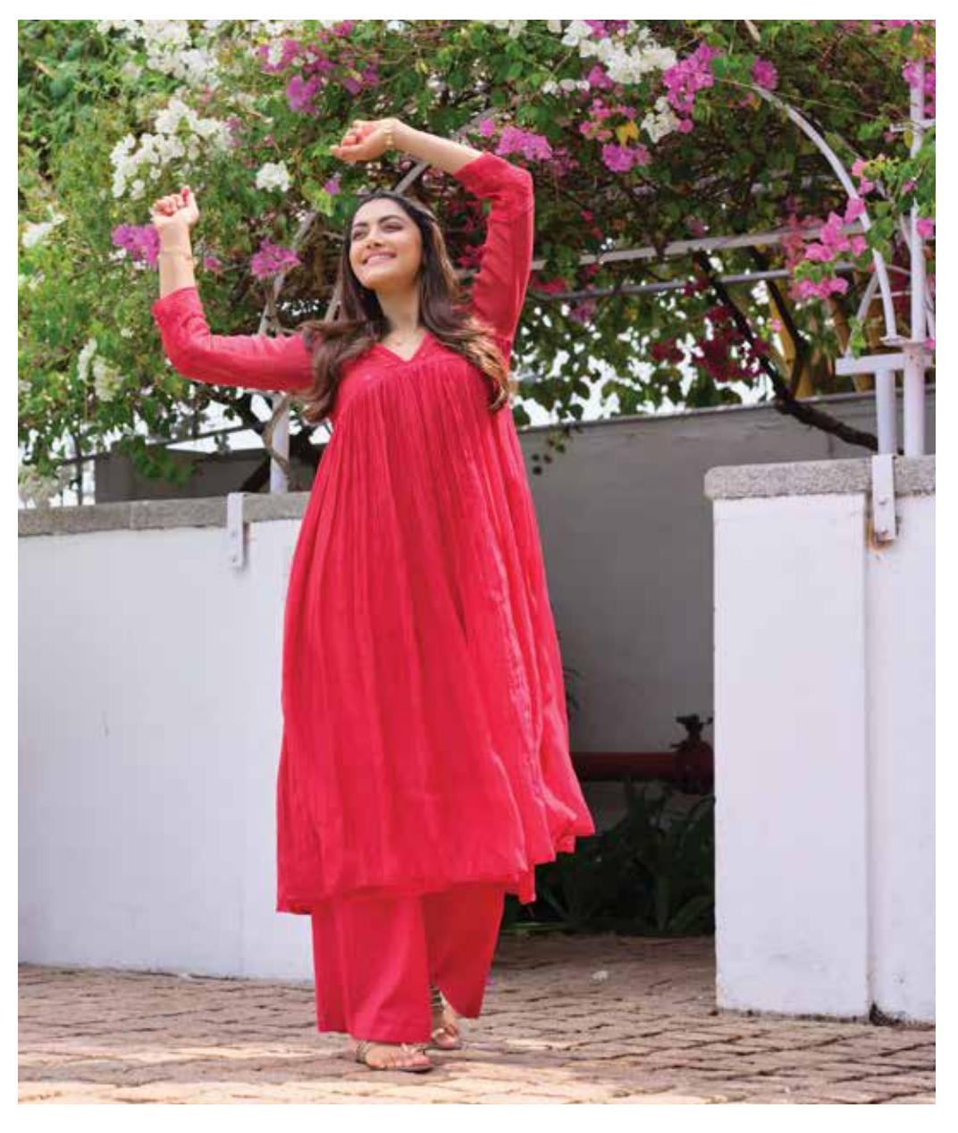
Crafted for the daily hustle, this collection ensures easy-breezy comfort without compromising on fashion. With its impeccable design and practicality, embrace each moment in effortless elegance, staying chic throughout the day.