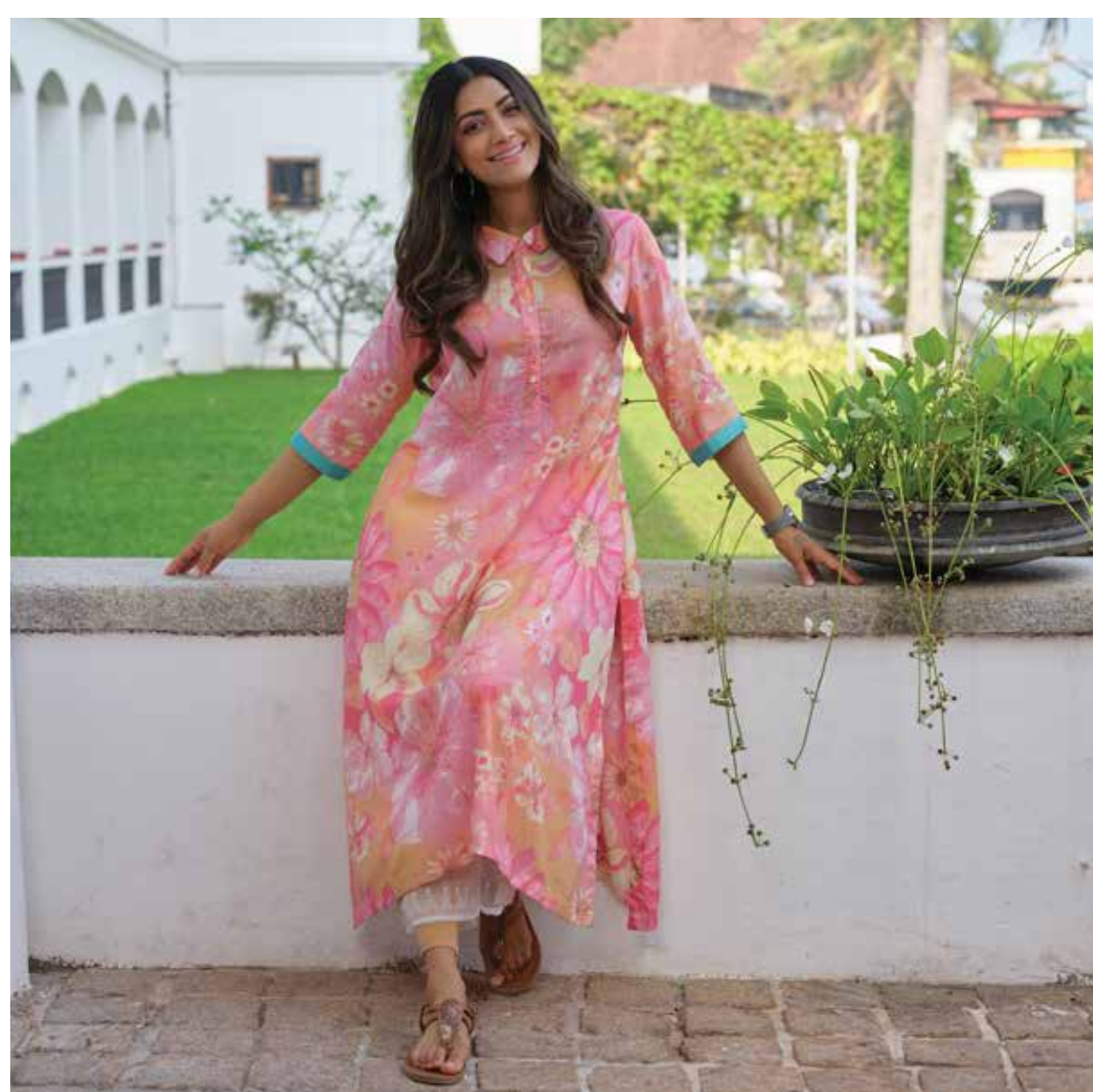
Designed with sophistication and practicality in mind, this kurti collection offers breathability and comfort, making it ideal for long hours at work. With its tailored fit and elegant design, it exudes professionalism while ensuring you stay cool and confident throughout the day.